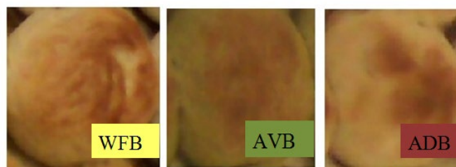
Figure 3: White bread (WFB), avocado improved bread (AVB), baobab improved bread (ADB).

The sensory analysis for products were described by semi-trained analysts by whom the data was analyzed in SPSS-20 for different attributes. The result was indicated (Table 5) for the 3 products.