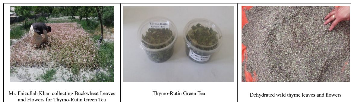
Figure 1: Pictorial View of Buckwheat Crop, Dehydrated wild Thyme Leaves and Developed Product Thymo-Rutin Green Tea.

The organoleptic/sensory evaluation for taste, color, flavour, mouth feel and overall acceptability conducted using nine point hedonic scale in accordance with the method described by Larmond. 43 The panel members were selected on the basis of their ability to discriminate and scale a broad range of different attributes of Green tea. An orientation program was organized for the panel members to brief them the objective of the study. The