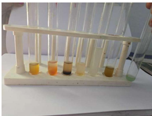
Figure 2: Estimation of Phytochemical

The result and discussion of the study on phytochemical screening horse gram chikki are analysed under following headings.