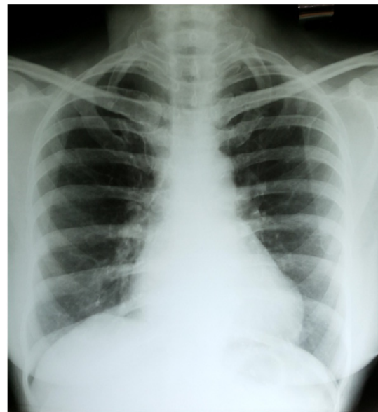
Figure 2. Complete Disappearance of Lung Lesion after Chemotherapy

chest revealed a 5×3.2 cm mass lesion in the right lower lobe. CT guided biopsy from the lesion favoured squamous cell carcinoma. There was no evidence of local recurrence. She received chemotherapy with cisplatin and 5 fluorouracil with a view to consider surgical treatment after 3 cycles of chemotherapy. But achieved complete response with chemotherapy. Post chemotherapy scans showed no evidence of disease and surgery was not done. Her chest X-rays, before and after chemotherapy are shown in Figures 1 and 2. She is on regular follow-up with clinical examination and chest X-rays performed every 6-months for the first 3- years and then yearly afterwards. She is asymptomatic since January 2019.