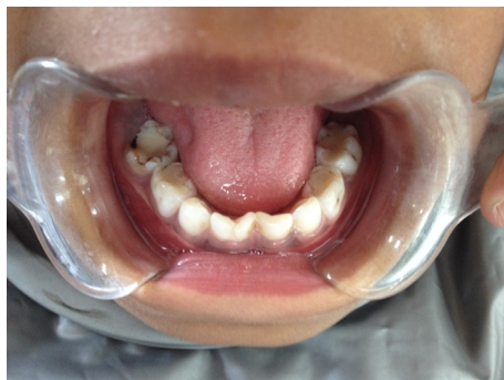
Figure 3: Clinical Image Showing Occlusal View of Bilateral Fusion of Primary Mandibular Incisors after Restoration of 85.