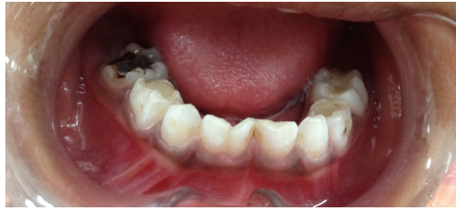
Figure 1: Clinical Image Showing Bilateral Fusion of Primary Mandibular Central Incisor and Lateral Incisor.