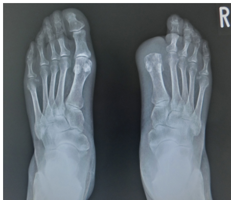
Figure 1. X-ray of the Bilateral Feet After the Operation

The general status and DFO were gradually improved. On 17 th day from the admission, she received the surgical operation of an amputation at the right toe. The osteotomy was performed between 1 st metatarsal and proximal phalanx (Figure 1). The operation was successfully achieved and the progress condition after the operation showed improvement. After the operation, blood glucose showed improvement than before the operation (Table 1, middle). After 18-days of operation, she was discharged from the hospital.