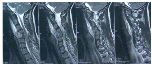
Figure 3. Lateral Cervical X-ray, Performed Post-operatively

Under general anesthesia and supine position, a right-sided Smith – Robinsons approach through a 5 cm standard transverse incision was used. C4 and C5 partial corpectomy and stabilization of C3 to C6, were performed. An iliac crest graft was set on the corpectomy defect in the first stage. Later, the iliac crest graft was removed and titanium mesh filled with autologous bone graft and cervical plate (Medtronic spine, Minnesota, USA) was used for anterior fusion of C3 to C6. In the third stage, the patient was positioned prone in a Mayfield head holder. A midline 9 cm skin incision was made starting at the external occipital protuberance. The lateral masses of the C3-6 were subsequently exposed by subperiosteal dissection. Then, the lateral mass screws (Medtronic spine) was placed in C3-6 lateral masses, using Magerl technique (Figure 3). 8 Eventually, proper drainage was placed and a Philadelphia cervical collar was used to post-operative neck immobilization (8 to 12-weeks). The patient was discharged from the acute care when she was medical-