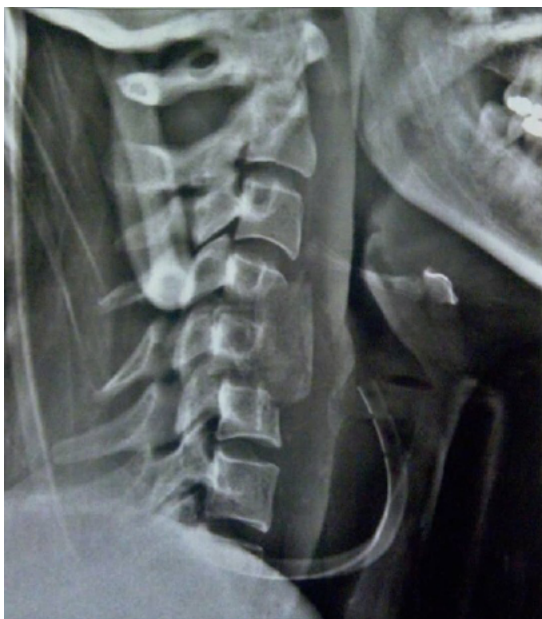
Figure 1. Lateral Cervical X-ray, 3-Hours after the Trauma Reveals a Fracture-Dislocation of the 5 th Cervical Spine