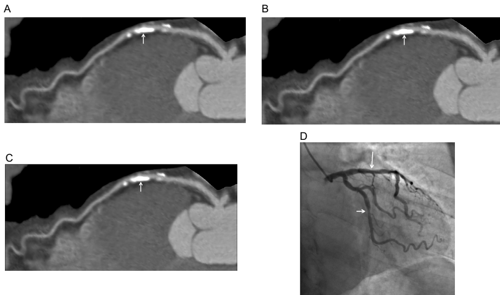
Figure 2: Curved planar reformatted coronary CT angiography (CCTA) shows multiple calcified plaques at the left anterior descending coronary artery (LAD) in a 59-year-old man. CCTA original data (CCTA_O) shows 69% stenosis in LAD due to the heavily calcified plaque, while CCTA with “sharpen” algorithm (CCTA_S) demonstrates 45% stenosis, and 68% stenosis as shown with CCTA with original data integrated with outcome of smoothed image subtracted from the original (CCTA_OS) (A-C). Invasive coronary angiography confirms mild stenosis of 28% at LAD and 44% stenosis at LCx (D). Long and short arrows refer to the stenosis at LAD and LCx, respectively. Reprinted under terms of Open Access article from reference. 24