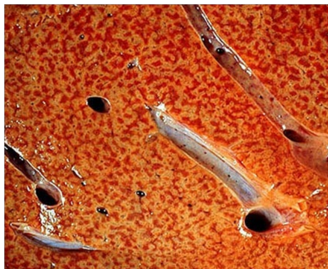
Figure 1: Cut surface of the congested liver reminiscent of the classic “nutmeg appearance” which is caused by chronic passive congestion of the central veins with hemorrhage and necrosis in zone 3. Red cells pool and distend the sinusoids around the central vein. These regions develop a darker red-violet color, in contrast to the surrounding tan liver parenchyma.

On gross examination, the congested liver is an enlarged, purple-hued organ with prominent hepatic veins. The cut surface conforms to the classic “nutmeg” appearance, reflecting the alternating pattern of hemorrhage and necrosis of zone 3 (red) with normal or slightly steatotic areas in zones 1 and 2 (yellow) (Figure 1).