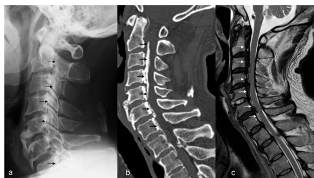
Figure 3: OPLL Diagnosis using Three Modalities: 73-Year-Old Male.