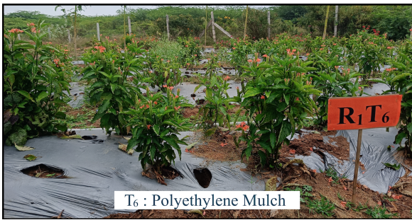
Figure 1. Treatment plot Polyethylene mulch of Crossandra infundibuliformis

objective of ensuring ecological safety and sustaining high levels of crop productivity across agro-climatic regions.