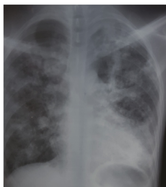
Figure 2: A chest X-ray showing military tuberculosis.