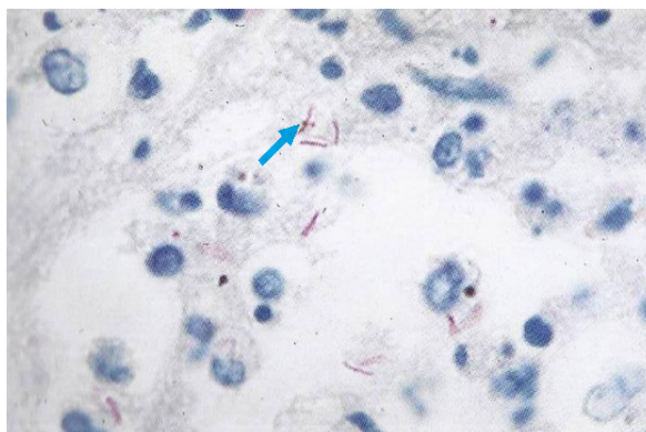
Figure 1: Red acid-alcohol fast bacilli in a Ziel-Neelsen stain showing the causative organism for tuberculosis found in a sputum sample.

A full blood count is recommended as some patients may be anaemic due to chronic ill-health. Those not yet screened for HIV must have this test done as the two conditions usually coexist. 7 A chest X-ray with abdominal shielding must be done which may reveal pulmonary tuberculosis. Typical chest X-ray findings include military picture (Figure 2) and cavitations (Figure 3). Enlarged lymph nodes can have fine needle aspiration for histological examination. If there are signs and symptoms suggestive of tuberculous meningitis a lumbar puncture should be done and the cerebrospinal fluid sent for microscopy and culture. Tuberculosis screening as part of antenatal care in high prevalence regions may be helpful 12 to pick up latent tuberculosis. Early diagnosis would reduce morbidity and mortality rates.