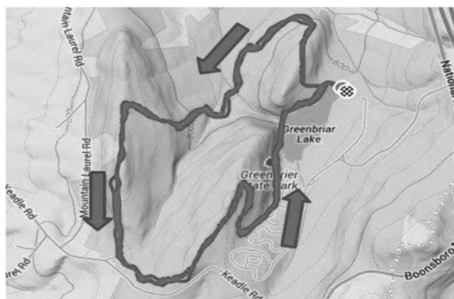
Figure 1: Lap outline and profile with Start/Finish area indicated.

Participants completed a regional mass start XCO-MTB competition (Greenbrier Challenge, American Mountain Bike Challenge, Mid Atlantic Super Series, Boonsboro, MD, USA) sanctioned by USA Cycling. Each lap was 7.5 km, had 266 m of elevation gain and was of moderately technical terrain (Figure 1). Quantification of performance via race time using radio frequency identification timing chips (Mid Atlantic Timing, Downingtown, PA, USA). As participants completed this race as part of their own racing schedule and were given no protocol of which to adhere before, during or after the race regarding pacing or strategy. All participants completed the race without mechanical incident on their own bicycles. Lap times were reduced to mean time across four laps, as XCO-MTB athletes have been shown to have little between-lap variation during races. 18