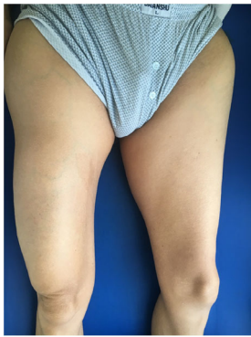
Figure 2. Voluminous Mass, Measuring 20 cm on the Right Tigh and Extending above the Knee, of Firm Consistency