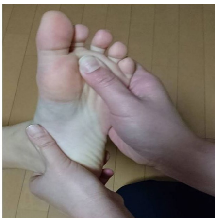
Figure 1: Reflexology is the Gentle Manipulation or Pressing of Certain Parts of the Foot to Produce an Effect Elsewhere in the Body.

The lymphatic reflexology technique can be used to treat specific conditions, such as leg, foot and generalized edema, as it moves extravascular fluid without disturbing the intra-