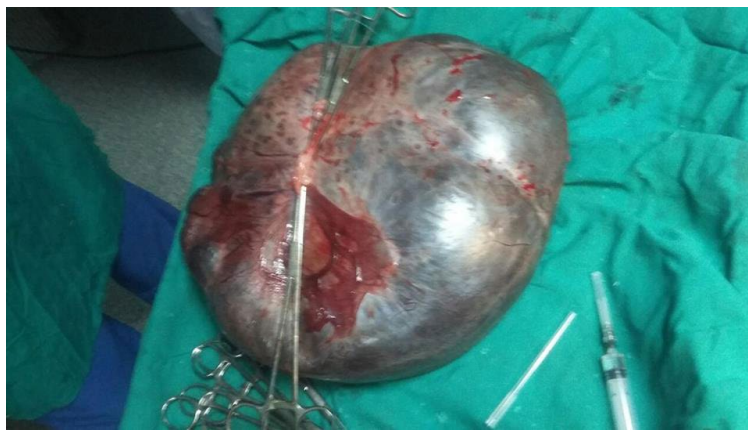
Figure 2: Ovarian Cystectomy during Cesarean Section.

were performed during cesarean section. Operated cysts were most often organic cysts (74.39%). No malignancies were observed, and 3 cases of borderline tumors were diagnosed. There were no obstetrical or neonatal complications (Figure 2). 51