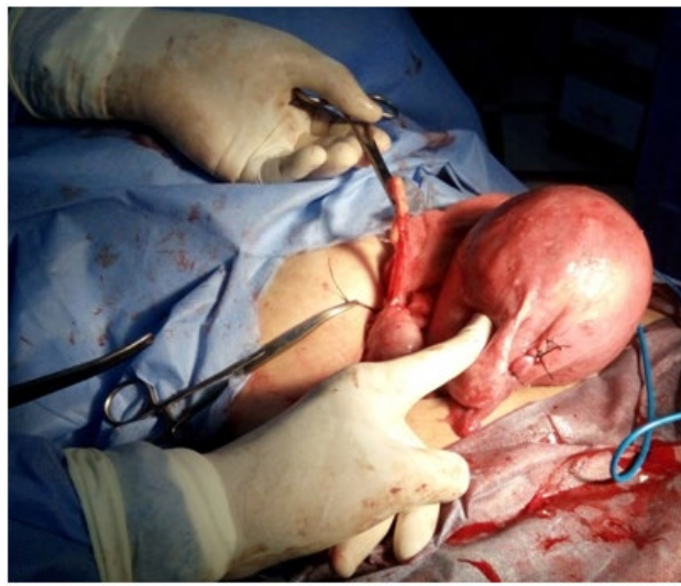
Figure 3: Appendectomy and Tubal Sterilization during Cesarean Delivery.

Pearce et al 54 performed appendectomy on 93 patients after receiving their written consent to undergo elective cesarean section in a clinic population. The parameters assessed were clinical infection, blood loss, and gastrointestinal tract recovery rates. They found that these parameters were equal in both Groups. Operative time was extended by 15 minutes to the total operation time and the hospital stay was extended by about 12 hours. There were no wound infections or serious morbidity. Prophylactic appendectomy in selected cases, such as women with abnormally appearing appendix, a history of pelvic pain,